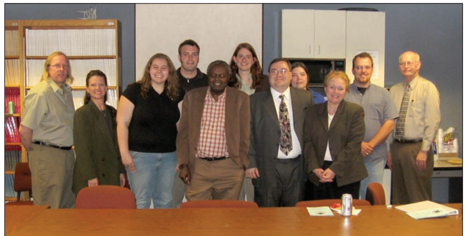
Some of the Phi Alpha Theta inductees and faculty at this spring's induction ceremony