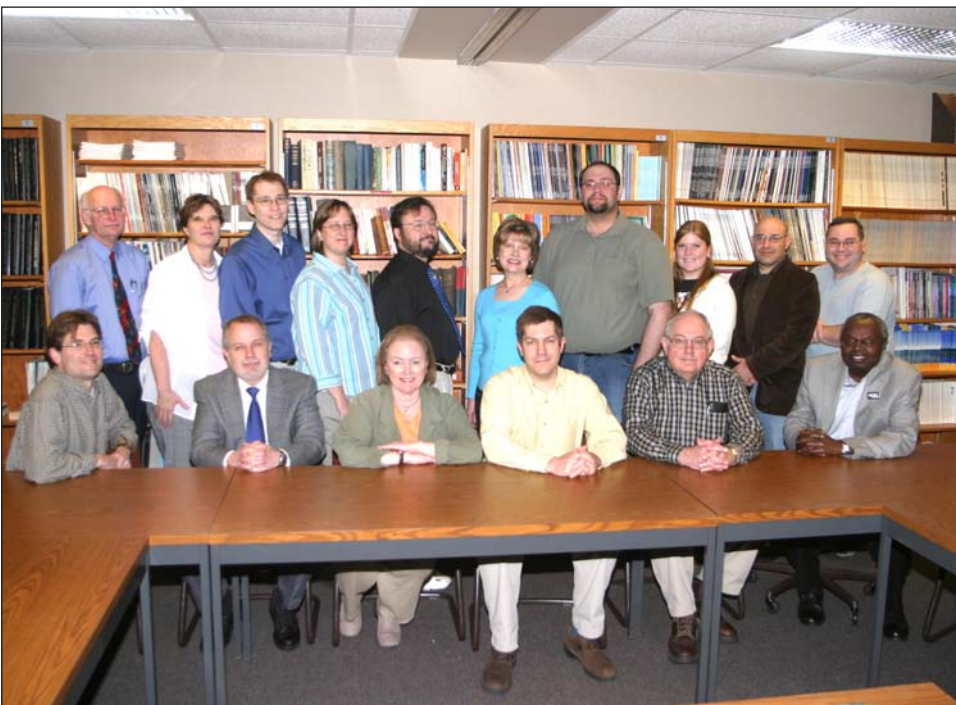
Some of the faculty and staff of the History Department.