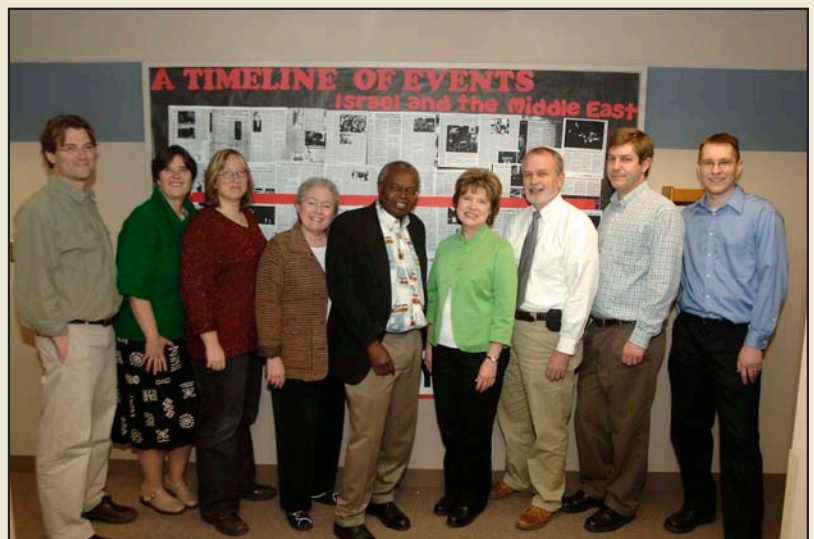
Some of the faculty and staff of the History Department