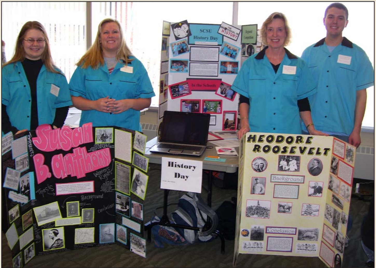
History Day Awards