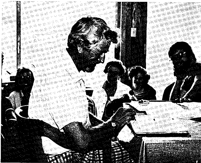
Author Frederick Manfred