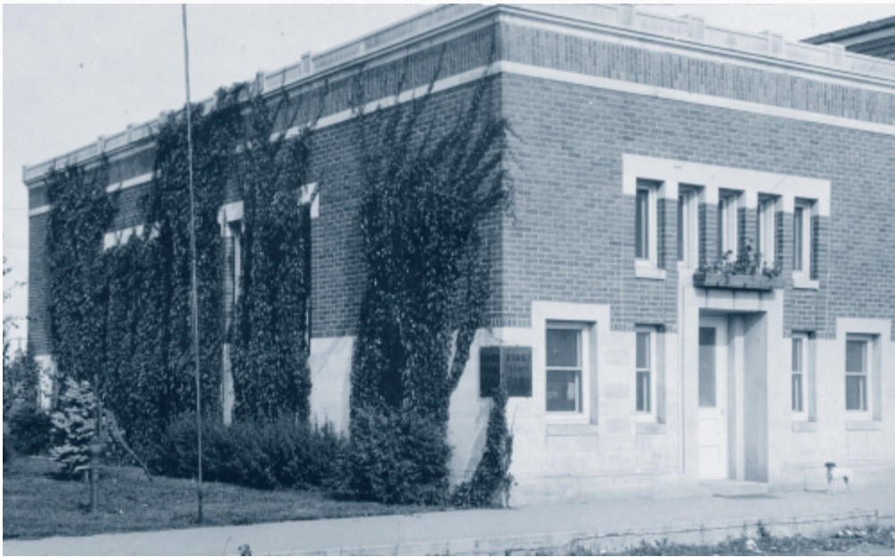
First State Bank of Okabena