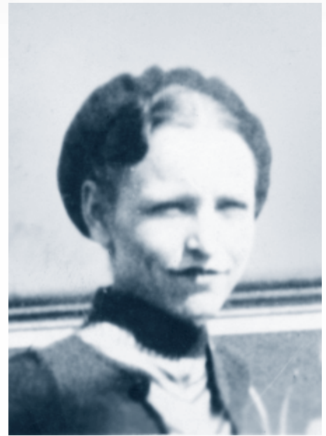
LEFT: Clyde Champion Barrow and his V-8 Ford, photo sent during his lifetime to the Minnesota Bureau of Criminal Apprehension. RIGHT: Bonnie Parker, also from the history files of Minnesota's BCA.

and a ghost-written book attributed to Bonnie's mother and Clyde's sister, all claiming Okabena as a Barrow Gang robbery. What these sources describe, however, is not Okabena, but the botched attempt at Lucerne, Indiana, a week earlier. In that incident, Clyde and his brother Buck broke into the bank at night. Buck's wife, Blanche, with Bonnie riding shotgun, drove up to the bank the next morning to pick them up. Two bank cashiers arrived for work, but when Clyde and Buck tried to apprehend them, the men grabbed concealed weapons and thwarted the robbery. The Barrows got no money and were forced to flee. They raked the town with machine-gun fire as they sped away in their black Ford sedan. 21