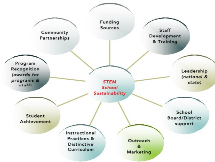
Figure A. Nine Elements of STEM School Sustainability