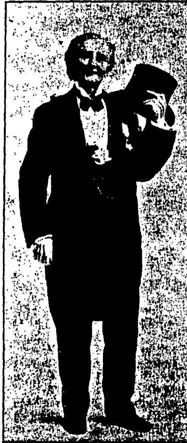
Dr. Mary Edwards Walker

I soon discovered more twists to her life than I'd ever expected—Mary wore men's clothing throughout her long life. She was first loved, then ridiculed by suffragists. She was the first woman to receive the Congressional Medal of Honor. The U.S. government later took it away from her but she refused to give it back and wore it until her death. It wasn't until a couple decades ago that it was "re-awarded" to her relatives.