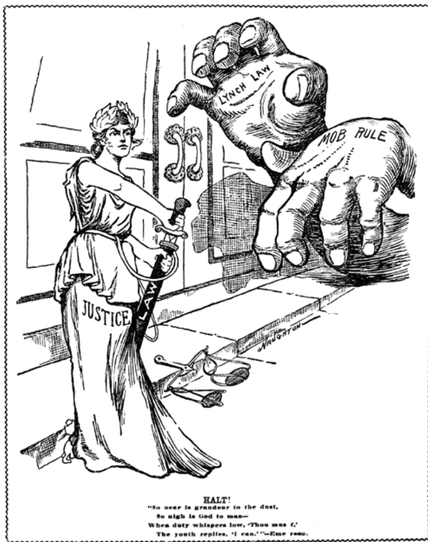
Front-page commentary on the problem of lynching nationwide, Minneapolis Tribune , July 23, 1903