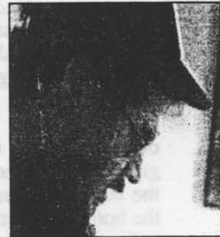
Alleged robber attempts to use ATM machine.