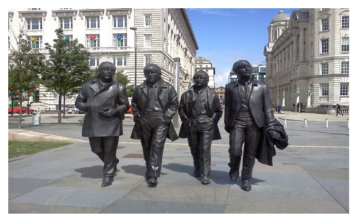
Beatles statue, Fab Four stepping out with the Three Graces buildings. Testament to Liverpool's Maritime industiral past.

reframing of Liverpool as Beatles City, with various memorials and museums dedicated to the Fab Four. With plans to visit these sites, along with others including Titanic Belfast, Manchester's Museum of Science and Industry (with working demonstrations of various machines from its former cotton-milling industry), Liverpool FC and Manchester United's Premier League football stadia, and The Lowry and Media City in Salford Quays, students on the 2017 British Isles Program will benefit enormously from reconnaissance made possible with greatly appreciated support from the School of Public Affairs Internationalization Grant.