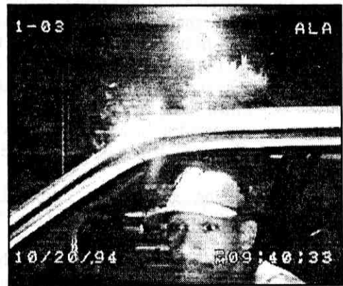
Deputies released this ATM photo of 1 of 2 men suspected of kidnapping a UCF student at gunpoint. The student escaped.