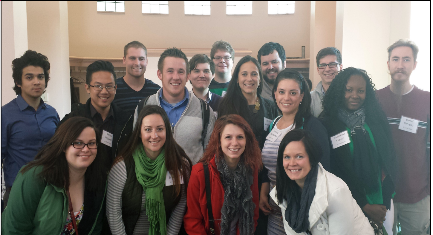
Faculty and students attended the Minnesota Economics Association annual conference held at Hamline University.