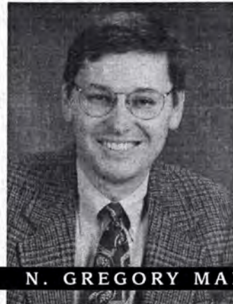
N. GREGORY MANKIW

N. Gregory Mankiw is Professor of Economics at Harvard University. A prolific writer, Mankiw has published over 100 articles in such journals as the American Economic Review , Journal of Political Economy , and the Quarterly Journal of Economics on topics such as economic growth, budget deficits, monetary economics, and macroeconomic policy. He is a past recipient of several NSF grants and an Olin Fellowship. He is Director of the Monetary Economics Program at the National Bureau of Economic Research, an advisor to the Congressional Budget Office and the Federal Reserve Bank of Boston, and is an associate editor of two respected journals.