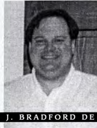
J. BRADFORD DE LONG

He received an A.B. summa cum laude from Princeton University in 1980 and a Ph.D. from Massachusetts Institute of Technology.