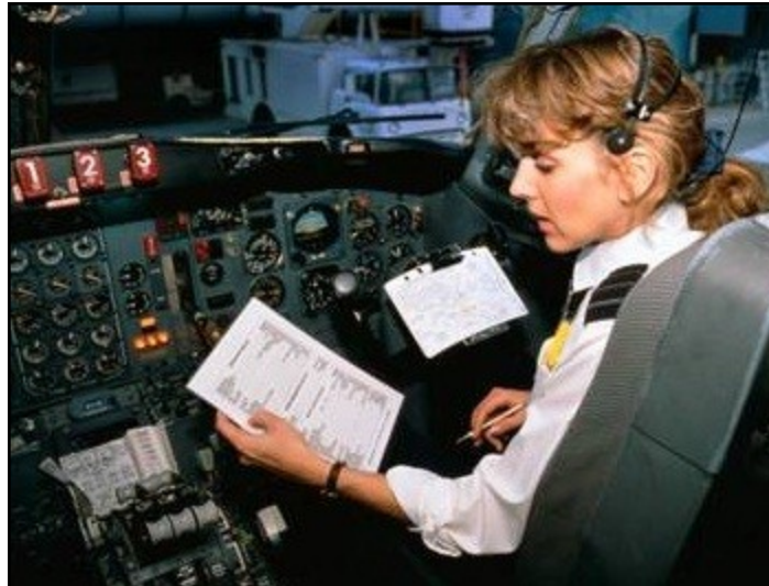
Worldwide shortage for airline pilots & other aviation personnel set to get worse.