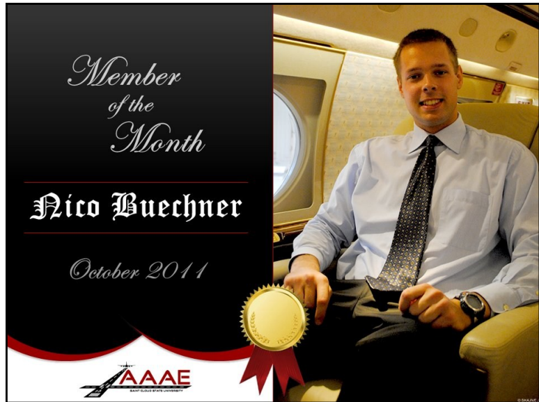
SCSU aviation students are “first class” when it comes to volunteering, serving the community & for who they are as young future professionals. Thanks for all you do!