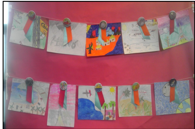
Kids Color awards at the St. Cloud Regional Airport. Aviation merit badges were also awarded to participating scouts.