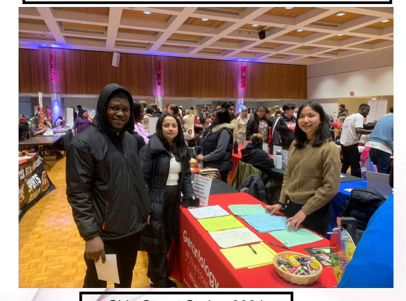
Side Street Spring 2024

Thank you to all of our community partners for your ongoing support and hosting student interns and service-learners!