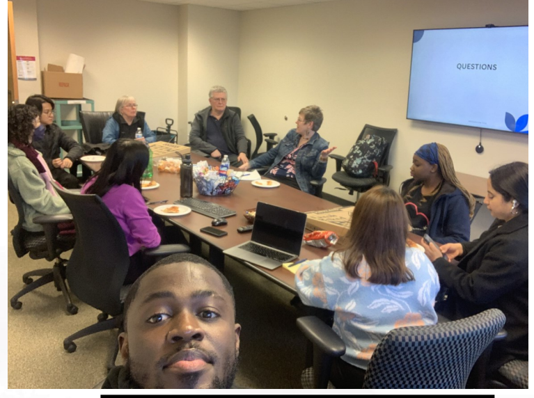
First GERO Club Meeting of Spring 2024