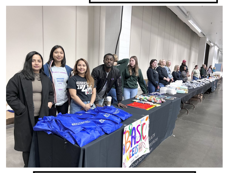
Project Homeless Connect Fall 2023