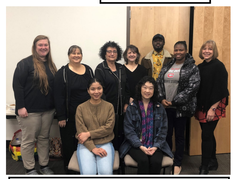
GERO Students, Alumni & Faculty at ANA, Sping2023