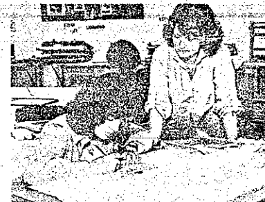
SUMMER EMPLOYEES AT WORK